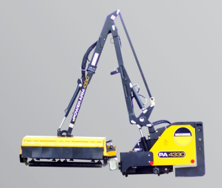
Boom Flail Mowers 47" cutting width; 14' reach